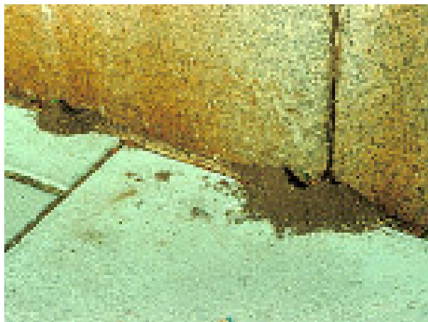
Pavement ant mounds (EPA)

so be patient. If used correctly, most ants will be controlled without having to apply any insecticides in the home.