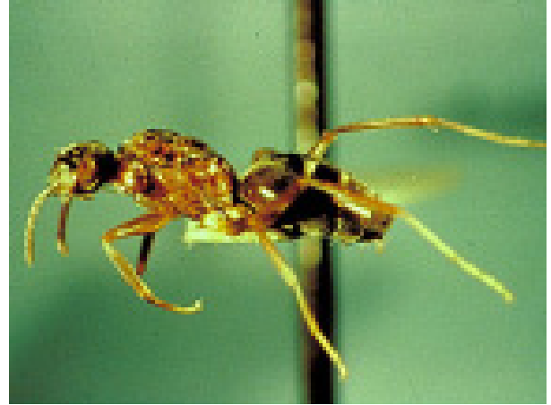
Odorous House Ant (EPA)

Adult winged males and females emerge from their cocoons and eventually leave the nests. Emergence of large numbers of ants (swarming) usually occurs at certain times, and often this is the only time we notice the ants at all. Males seek out females in the swarm; mating usually occurs in the air. Males die soon after the mating flight, while the female seeks out a crevice or similar hiding place. She then removes her wings, forms a small cell, and lays a few eggs. The eggs hatch into tiny, white, legless grubs. The queen feeds these grubs, or larvae, with a nutritious fluid that forms in her digestive system. When the grubs are fully-grown, they change into a nonfeeding pupal stage from which emerge the common “worker” ants. These workers begin to forage for food, some of which is fed to the queen and some to the new larvae from the next lot of eggs. Adult workers may live for weeks, or up to two years