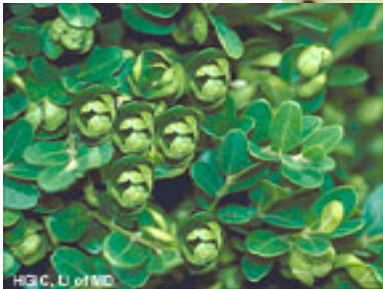
Winter damage on Boxwood