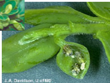
Psyllid damage on Boxwood

The boxwood psyllid, Psylla buxi , causes a characteristic cupping of the leaves on the terminal and lateral buds of boxwood. This insect can overwinter as an egg, or as a first instar nymph under the bud scales. As the buds develop in the spring, the eggs hatch and nymphs emerge to infest the leaves. The feeding causes the leaves to curl and form a cup which encloses the greenish colored nymphs. The nymphs produce a white, waxy secretion which may cover part of the body or small waxy pellets beside the nymphs. The greenish adults emerge late May into June, mate and lay eggs under the bud scales. Only one generation occurs each year. This pest causes aesthetic damage to American boxwood and English boxwood.