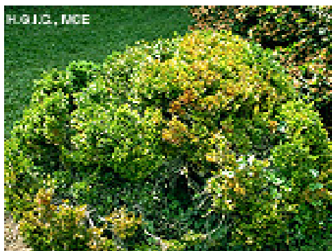
Winter damage on Boxwood

Prevention: Winter damage can be reduced by locating plants in partially shaded areas protected from winter winds. Physical barriers, placed about 18 inches from the plants on the windward side, made from materials such as burlap or plastic, can also lessen winter wind damage by reducing wind velocity. Maintain adequate soil moisture in the fall to prevent winter desiccation. To avoid damage from falling snow and ice do not plant boxwoods under roof eaves. For established boxwoods, tie a string or twine at the base of the plant and spiral the twine up and down the plant to hold it together and gently brush snow off plants as soon as possible. This will help prevent damage from falling ice and snow. Inspect plants for winter damage in the spring and prune out affected areas.