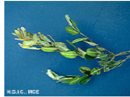
Volutella stem blight

Control: Diseased branches should be pruned out and when the foliage is dry, plants should be thinned to improve air circulation and light penetration. Old fallen leaves and diseased leaves that have accumulated in the crotches of branches in the interior of the plant should be shaken out and removed. Properly timed applications of copper fungicides or lime sulfur applications can be used in severe infections. Sprays will not cure diseased branches. Spray applications should start just before new growth begins in the spring and continue until new growth is completed. Additional sprays may be needed in the fall to protect late summer growth during rainy seasons. Adequate spray coverage is essential for disease control and thick foliage will prevent spray penetration which will reduce the effectiveness of disease control.