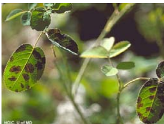
Black spot on rose

Black spot is the most important fungal disease of roses worldwide. The initial symptoms start as feathery edged, black spots on lower leaves. As these spots enlarge the leaves turn yellow and drop off. The disease will continue up the stems until the entire plant may become defoliated. Stem lesions are less obvious, but start as dark irregular blotches that eventually become blistered. Stem lesions are the most important source of fungal spores for initiation of the infection cycle next season.