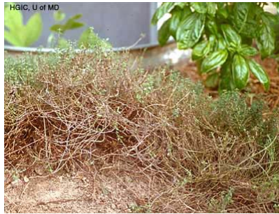
Southern blight on thyme

When a plant or part of the plant (leaf, flower, fruit) rapidly collapses and dies the symptom is called a blight. Many bacteria, fungi and viruses can cause blights. Most blights are favored by certain weather conditions, such as hot and humid or cool and moist.