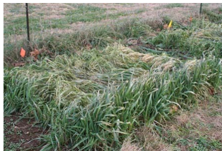
Oats planted in the fall beginning to die from cold winter temperatures