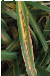
Daylily leaf streak - photo courtesy of Univ. of Illinois Extension

Daylily leaf streak, caused by the fungus Aureobasidium microstictum is very common disease on daylilies. The first symptoms are visible in early spring as dark green spots that later turn into brown spots along the leaf midrib. These spots quickly run together under wet weather conditions and cause brown streaks typically with yellow margins that extend the entire leaf length. Infected leaves eventually will turn yellow or brown and die.