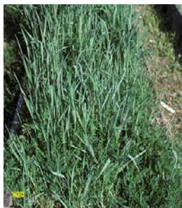
A mixture of winter wheat (tall plants) with hairy vetch (vining plants)

Farmers have been growing cover crops for thousands of years to increase crop yields. Cover crops, also known as green manures, are an excellent tool for vegetable gardeners, especially where manures and compost are unavailable. They lessen soil erosion during the winter, add organic material when turned under in the spring, improve soil tilth and porosity, and add valuable nutrients.