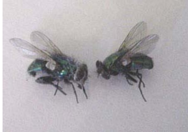
Cluster flies

Answer: It sounds like you may have cluster flies. They often become active on warm, sunny, fall or even winter days. Cluster flies are larger than house flies, dark gray, and non-metallic.