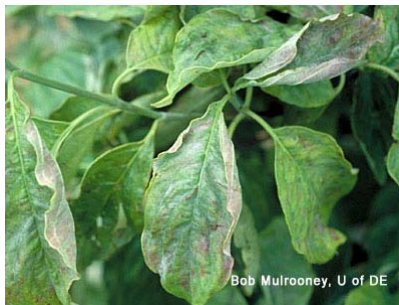
Powdery mildew on dogwood