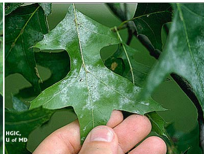
Powdery mildew on oak