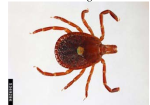
Lone star tick

The Lone star tick , Amblyomma americanum , attacks humans and is a carrier of tularemia, occasionally Rocky Mountain Spotted Fever and possibly Lyme disease. The unfed adult female tick is about 1/8 of an inch long, reddish brown, with a whitish spot in the middle of its back. A fully fed female may be up to 7/16 of an inch long and 3/8 of an inch wide. It does not survive indoors.