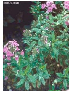
Powdery mildew on phlox

Powdery mildews grow as a white powdery coating over the surfaces of leaves, buds, flowers, twigs and stems. Another characteristic of powdery mildews is that they produce their sexual spores within a round dark colored structure called a cleistothecium. These structures observed under a hand lens appear as very small dark spheres with attached