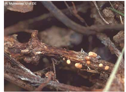
Southern blight on stem

Southern blight is caused by the fungus Sclerotium rolfsii . This fungus can attack probably all herbaceous perennials. It is active only during hot weather, so plants can grow well in infested soil during most of the growing season, and only become damaged during the hottest part of the summer. The first symptoms seen are wilting and collapse of individual stems or entire plants. Close inspection of the stem at the soil line reveals white mycelium (strands of fungus growing on the stem and mulch or soil surface), and small (1/8 to 1/16 inch), tan spherical sclerotia, that resemble mustard seeds (They are white when first formed, and gradually over several days turn brown). Roots of infected plants are unaffected. Cortical decay of the stem at the soil line is common during hot, humid weather.