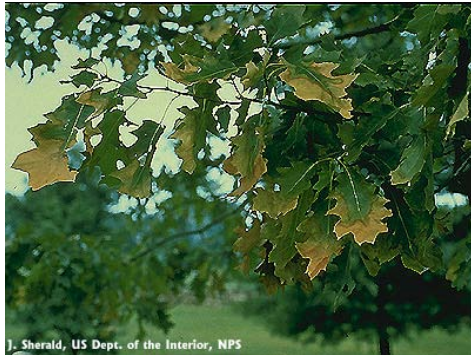
Bacterial leaf scorch on oak

Bacterial leaf scorch is a relatively new disease of shade trees and affects a large number of plants including elm, oak (see photo), sycamore, maple, mulberry and hickory in the landscape. Symptoms typically appear in mid to late summer on lower branches as irregular marginal browning on interior leaves. Symptoms progress along the branch towards the tip. Symptoms will occur every year and progress through the crown. Scorched areas may have a yellow halo around them depending on the tree species. Reduced growth and dieback are also common in severely infected plants.