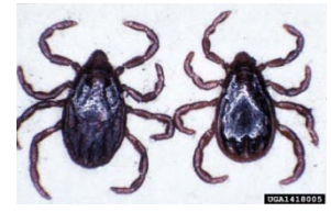
Brown Dog Tick