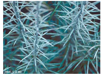
Powdery mildew on liatris

appendages. These fungi can over winter as spores on fallen leaves or in buds. Spores are carried to the leaves by air currents. The first symptoms of infection usually occur as a superficial white coating of mycelium on older leaves. Disease spread occurs as spores are released from the surface layer of mycelium. Perennials commonly troubled by powdery mildews include Aster , Centaurea , Coreopsis , Lathyrus , Monarda , Phlox , and Rudbeckia .