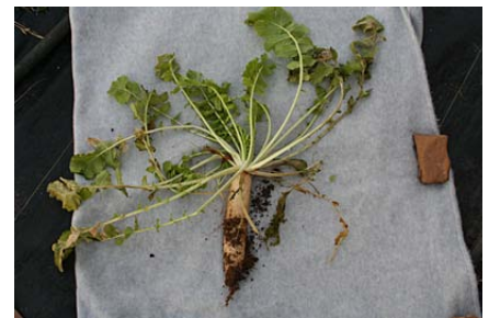
Fast growing daikon or forage radish sown in the fall produces a large root that can help break up compacted soil.

Popular fall-planted cover crops include oats, winter rye, winter wheat, crimson clover and hairy vetch (see the chart below). The latter two crops are legumes- plants that can add a lot of nitrogen to your soil after they decompose. These crops are typically planted as early as August 15, but no later than October 10. They should make some growth before the first hard frost. Some cover crops (oats and daikon radish) are killed by cold winter temperature, but most go dormant and resume growth in the spring. Cover crop roots grow deeply into the soil pulling up nutrients that might otherwise leach out of the soil. The crops are turned into the soil before going to seed, usually sometime in late April or early May. Other cover crops, like buckwheat and Dutch white clover, are sown in the spring or summer to cover and improve bare soil.