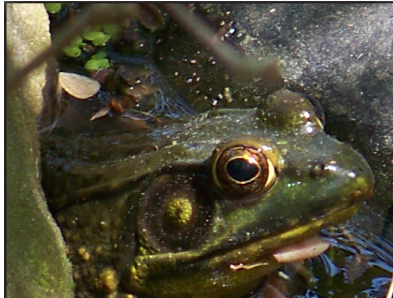
American Green Frog

What is a Herp you may ask? Herp is short for Herptile which is a name that collectively includes reptiles and amphibians. These