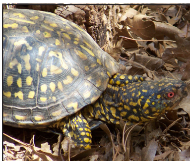
Male eastern box turtle (note the male's red eyes)

The mid-Atlantic region has a rich diversity of turtles, snakes, lizards, salamanders, frogs and toads. Herptiles play a very significant role in nature. They eat pests such as rodents (primarily the snakes); others feed on harmful insects, slugs