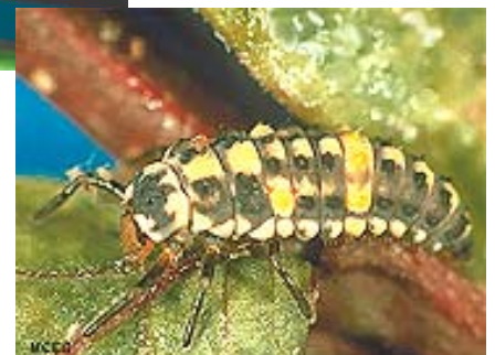
Ladybird Beetle Larva