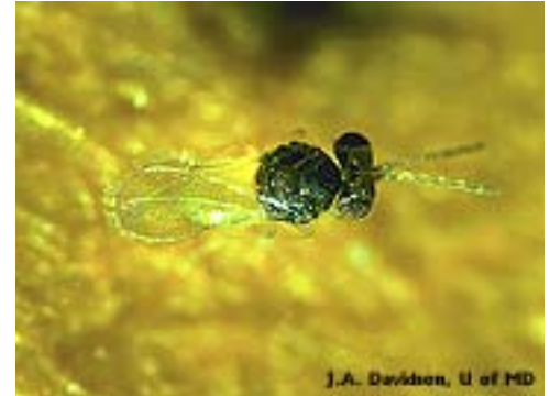
Encarsia (sp.) wasp

Parasitic wasps: a large group of small to large wasps that parasitize a variety of caterpillars, beetle larvae, flies, aphids and other insects. They are slender and black or yellowish to brown. They have a pinched waist and clear wings. Some females may have very long ovipositors or “stingers”, but they can not sting people. The female inserts her eggs into host insects. When the larvae complete their development, they spin cocoons on or near a dead or dying host, and then pupate. Parasitized hornworms are often seen with many white, silken cocoons attached to their bodies. Egg and larval parasites are available commercially.