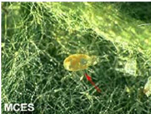
Adult Phytoseid Mite

Predatory mites: widely used as biological control organisms. They are the same size or larger than spider mites and move rapidly. The color may be white, tan, orange or reddish. Predatory mites are commercially available and the supplier can suggest the species and quantity to buy.