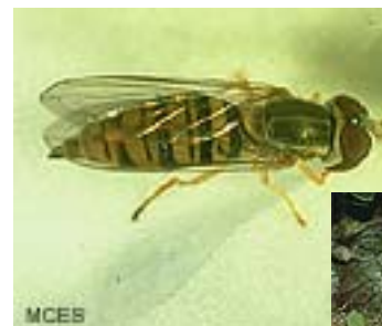
Flower fly adult and larva