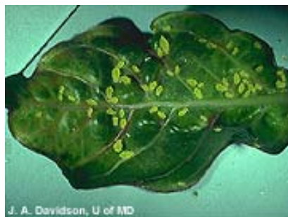
J. A. Davidson, U of MD

When aphids feed, they excrete "honeydew"; a sugary solution left after partial digestion of plant sap. This liquid falls on lower plant leaves, picnic tables, patios, and sidewalks. The honeydew dries into a clear, shiny spot. These spots often turn black because a black fungus called sooty mold grows on them. A dense sooty mold growth shades out sunlight and affected leaves may be weakened. Honeydew also has a useful purpose; it attracts predators and parasites of aphids.