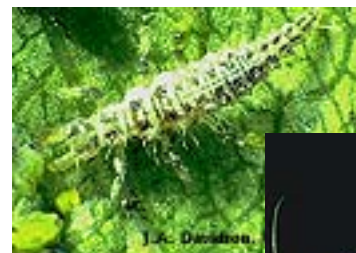
Lacewing larva and adult