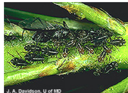
White pine aphids