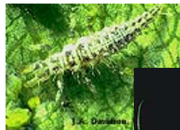
Lacewing larva and adult