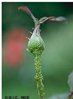
Aphids on rose