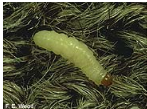
Clothes moth larva

The black carpet beetle adult is larger, a solid dark brown or dull black color, and more elongate oval than the varied carpet beetle. The black carpet beetle larva is 3-7 mm long and carrot shaped. It is covered with golden brown hairs and has a characteristic "tail" of long hairs at the rear end.