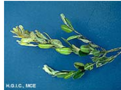
Volutella stem blight

Control: Diseased branches should be pruned out and when the foliage is dry, plants should be thinned to improve air circulation and light penetration. Old fallen leaves and diseased leaves that have accumulated in the crotches of branches in the interior of the plant should be shaken out and removed. Properly timed applications of copper fungicides or lime sulfur applications can be used in severe infections. Sprays will not cure diseased branches. Spray applications should start just before new growth begins in the spring and continue until new growth is completed. Additional sprays may be needed in the fall to protect late summer growth during rainy seasons. Adequate spray cov-