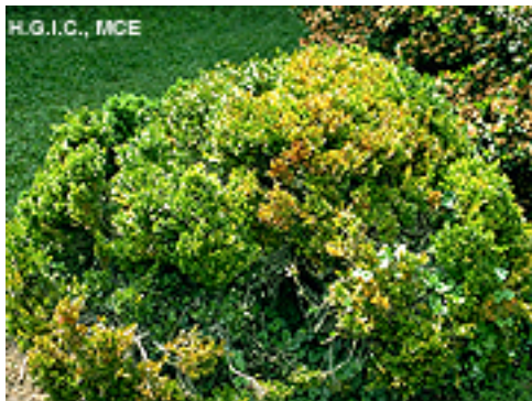
Winter damage on Boxwood

Prevention: Winter damage can be reduced by locating plants