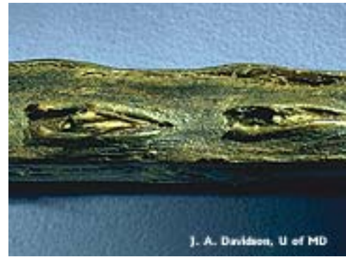
Egg laying slits in twig

Ornamental ponds should be covered with screen or plastic mesh to prevent cicadas from accumulating. Large numbers of decomposing cicadas could cause problems with oxygen depletion in the water. Clean pool skimmers/filters frequently during cicada emergence to keep them from getting clogged.