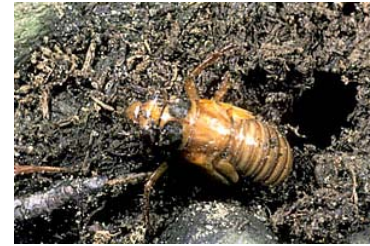
Cicada nymph emerging from soil

burrow into the soil and feed on the sap of tree roots for the next seventeen years. During the spring of their last year, the nymphs tunnel to the soil surface and emerge. Eventually they crawl onto tree trunks, posts and other upright structures and after a short period shed their skin to become winged adults. The empty skins are left clinging to objects.