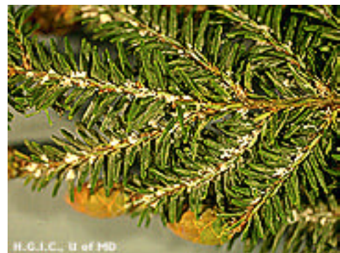
Hemlock Woolly Adelgid

The crawler is the dispersal stage and is spread primarily on the wind. Upon finding a suitable place to feed the crawlers settle, generally on branch terminals at the bases of needles. The